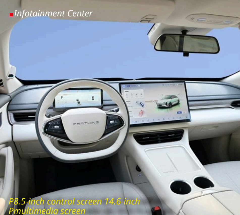
P8.5-inch control screen 14.6-inch Pmultimedia screen