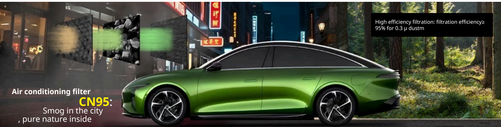
Air conditioning filter CN95: Smog in the city , pure nature inside

High efficiency filtration: filtration efficiency \geq 95% for 0.3 \mu dustm