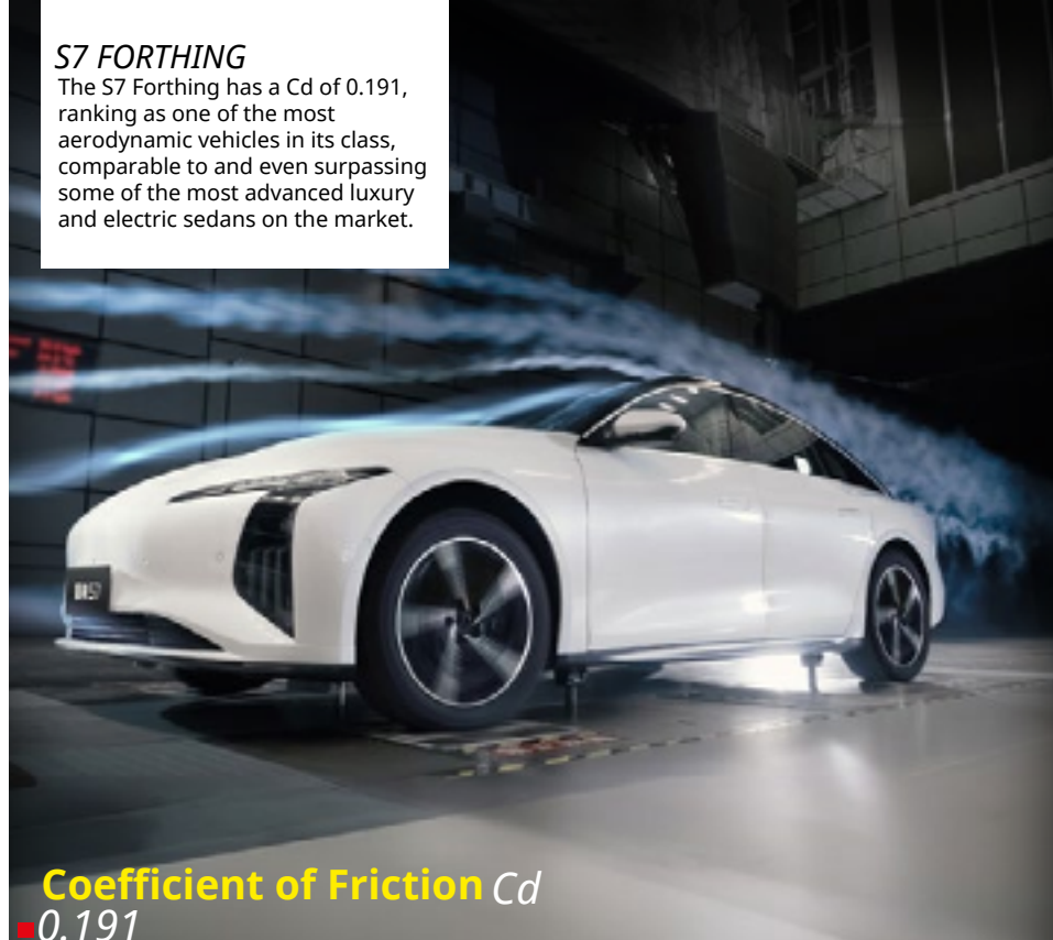
Coefficient of Friction Cd ■ 0.191

The S7 Forthing has a Cd of 0.191, ranking as one of the most aerodynamic vehicles in its class, comparable to and even surpassing some of the most advanced luxury and electric sedans on the market.